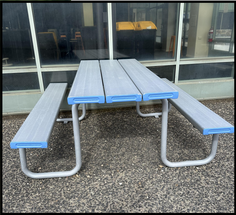
Example of the type of table to be used